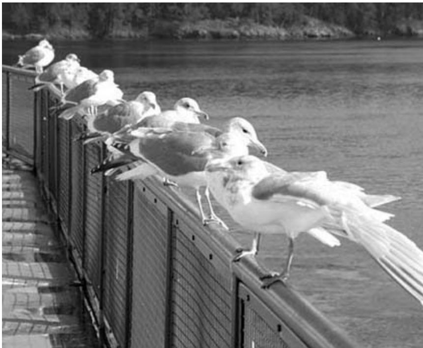
Glaucous-winged Gulls hitch a ride on the Illahee at Shaw Island. These birds know how to travel.

This year's Christmas Bird Count in the San Juan Islands was another successful addition to "the longest running database in ornithology, representing over a century of unbroken data on trends of early-winter bird populations across the Americas." There were 58 participants who counted on 5 islands including San Juan, Lopez, Crane, Shaw and Orcas. The participants traveled a total of 243.5 miles, of which 38.5 miles were on foot, and spent a total of 108 team hours. The total number of species observed was 102 and the total of individual birds was 17,260. The species count for this year was down by 2 while the individual numbers were up by over 1500, indicating no significant change. To view the data for the count go to: http://birdsource.org/ and click on 'Christmas Bird Count'.