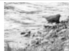
Yes, that's an American Dipper at Cascade Lake on Orcas. Some knew that by visiting our website:< http://sjiudubon.org/ >

E-mail recent sightings to the editor at: <dridgin@rockisland.com>